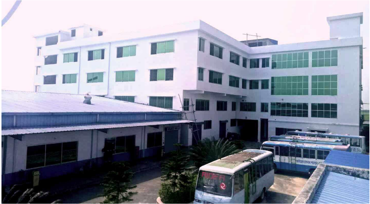
Factory Front View